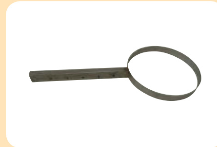
Feeder holder - for round containers 10/20/40/60 kg

The total size of the swivel arm (from standpipe to pendulum) is approx. 180 - 210cm.