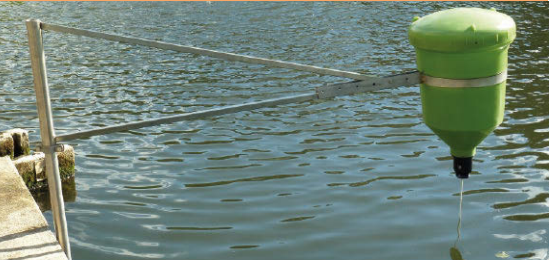
Profi pendulum feeder 40kg with swivel arm