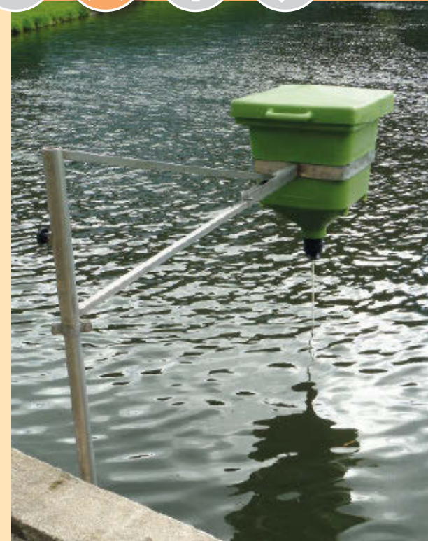
Profi pendulum feeder 50kg with swivel arm