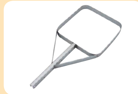
Feeder holder for rectangular containers 50 + 70 kg