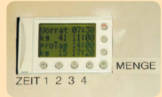
display of the timer shows the feeding programme

This LINN feed sprayer is equipped with a robust, waterproof stainless steel weighing cell, and so has the most convenient and precise feeding possibilities! LINN Germany introduces this groundbreaking innovation: Decentralized feed hoppers with individual weight sensitivity and control!