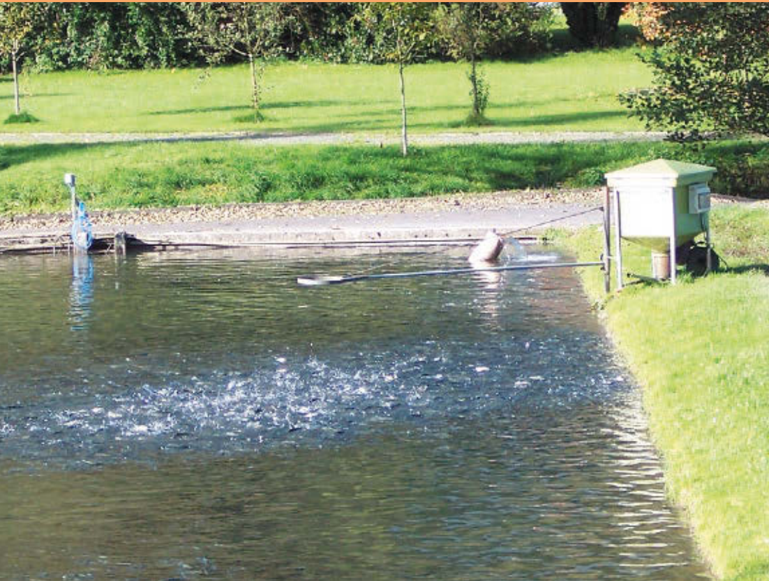
Profi Feed Sprayer working