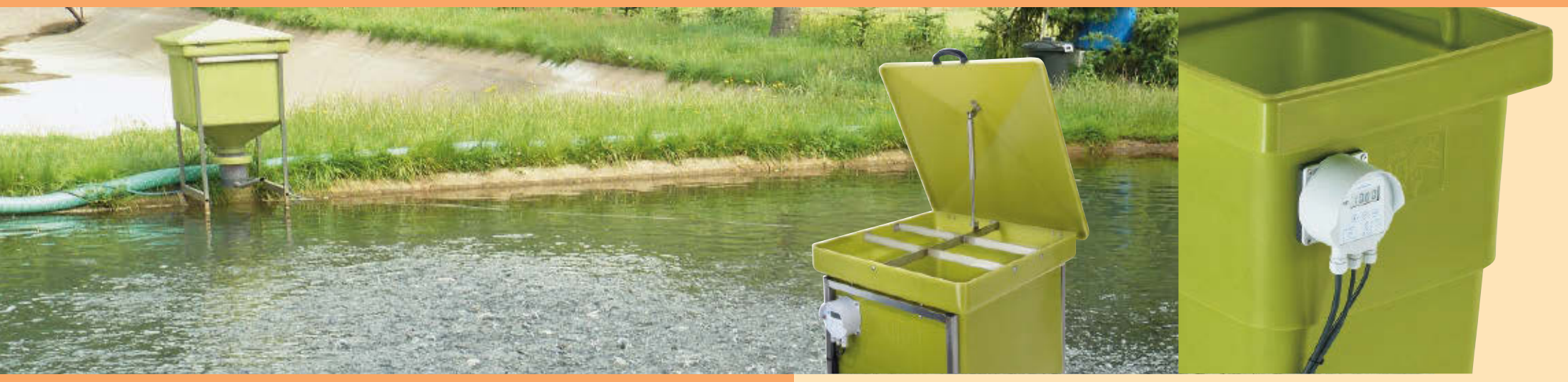
Profi Feed Sprayer working